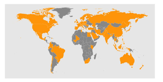
Figure 1: I have used ggplot2 and R to create many of the plots for the CHI 2018, 2019 and 2020 blogs.

visualisations by editing template visualisations. Attendees will make guided changes to these templates to produce individual bespoke visualisations. This practical component is detailed below.